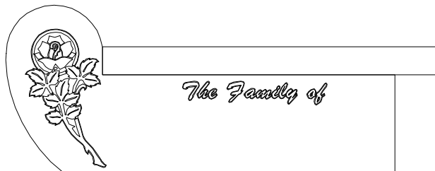
D1870 S 4-8 X 0-8 X 2-0 B 4-0 X 1-2 X 0-4